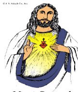
Most Sacred Heart of Jesus

CAN CATHOLICS BE CREMATED? In 1963 the Vatican lifted the ban on cremation. It is now an acceptable practice for Catholics. In 1997, the Vatican approved new liturgical norms allowing for the cremated remains to be present at a funeral Mass and the remains are to be treated with the same reverence as a whole body in a casket. Spreading the cremated ashes is still forbidden.